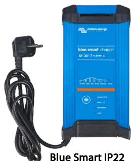
Blue Smart IP22 12/30 (3)