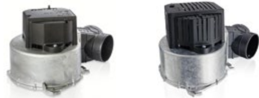
TEB-3, 12 V

A pleasant ambient atmosphere not only depends on the temperature. Warm air needs to circulate throughout your RV so you feel comfortable in your living area. You can rely on the powerful Truma fans to do this.